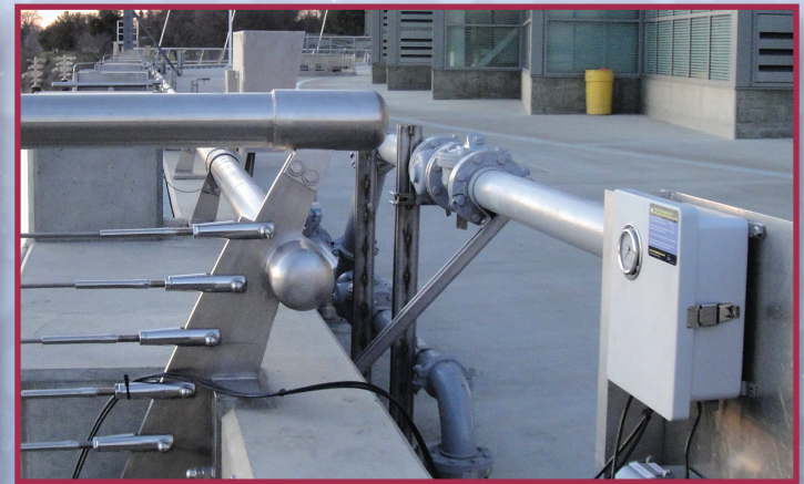
Designed to meet the specific requirements of each individual application.