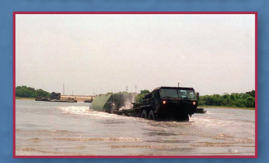
TO THE LOWS...